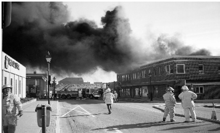
Early stages of the fire on May 8