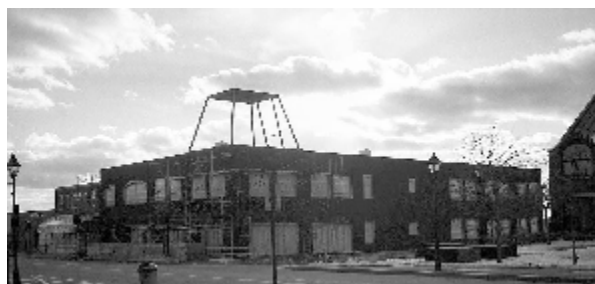
Construction 2003

Fire investigations and adjusters took over and were on the scene for weeks. It was complicated by the fact that the company occupied a maze of 12 different structures. Rarely a day went by without the discovery of additional problems and damages—to the point that the best choice was to demolish the buildings and build anew. “This was something my father and I had seriously looked at several times over the years but we simply did not see how we could justify it. Now we have to justify it.”