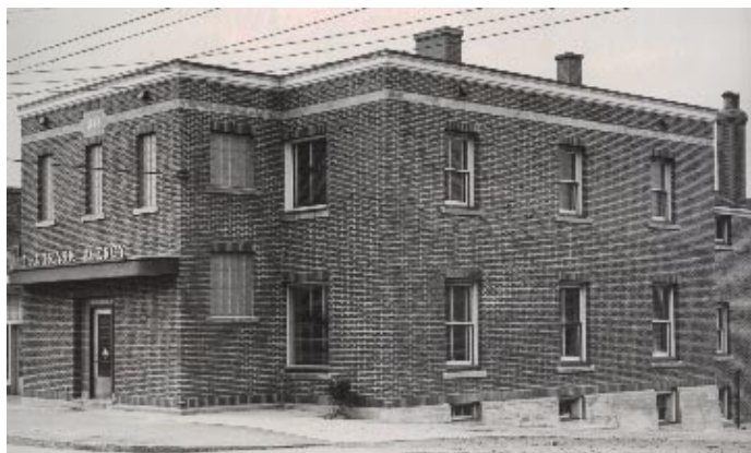
50s renovation