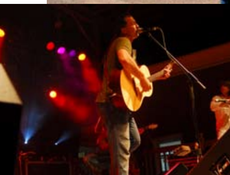
Top to bottom: Whale watching off Digby Neck, NS; LeNoir Forge Museum at Arichat in Cape Breton; La Viree performing at an Acadian Festival.

settled on a tour to the Maritimes offered by Ambassatours. “It was a trip full of wonderful surprises,” said the retired professor of communications from Shorter College. “The Cabot Trail was magnificent, with all that gorgeous scenery. And I was really impressed with the quality of the performance of Anne of Green Gables at the Confederation Centre of the Arts in PEI.”